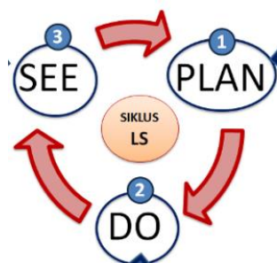
Figure 1. Steps for implementing Lesson Study (Eny W, 2017)

The three steps of lesson study are described in the following figure.