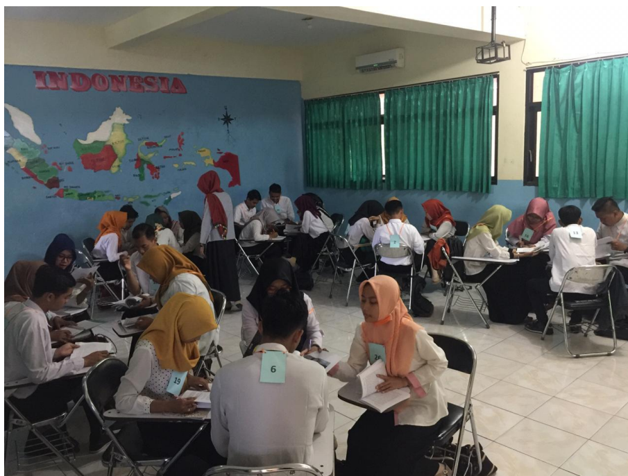
Figure 3. Implementation of learning in the Lesson Study class

On the one hand, it makes it easier for lecturers to serve student activities in groups. However, on the other hand, it is difficult for lecturers and peers (lecturer observers) to move from group to group because the room is divided into 7 groups. Then it was corrected by the lecturer directly and discussed together the correct answers to the questions raised in the Word Square questions. Several student representatives came forward to discuss the questions and answers from the word square. Here is a Word Square view of educational material in social stratification and mobilization.